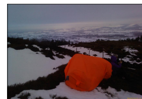
Mountain day, out in the snow

group leader stated that 'we are constantly referring to the information shared with us during our geography lessons in school'.