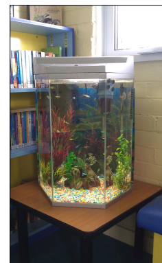
New fish tank in library area

Carlton now is home to some tropical fish—Located in the library, the tank adds (even more!) colour to the main building, as well as a nice distraction for visitors (and instructors...)