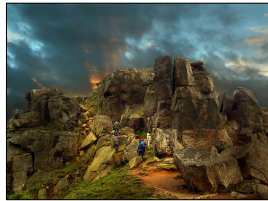
The Wainstones -great for adventure

We can help you and/or your children celebrate your big day with a flourish. As well as a specially laid on birthday 'spread', including all the old favourites such as cake, jelly and ice-cream, oodles of balloons and even - yes even- triangular sandwiches(!), Carlton can also provide a heady mix of exciting, high octane adventurous activities.