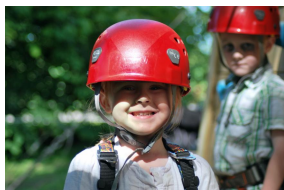
Smiles on the High challenge course

In August, Marlow Foods in Stokesley made an enquiry about using Carlton as a venue to host its annual charity gala day -this year for Cancer Research UK. Initially they wanted to hire the site only but through a spirit of collaboration and partnership the centre was able to offer them a lot more than this. There followed three weeks of intense organisation which included