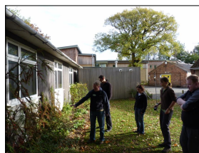
Setting small mammal traps