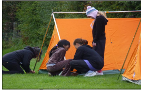
Putting up tents

Group camping returned to Carlton OEC in September when some courageous and enterprising teachers brought 43 Year 5s for an overnight camping