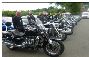
Triumph Rocket III motorcycles at Carlton

The Triumph Rocket III Motorcycle Club used the centre grounds for a week-end camping event in July.