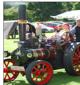
Traction engine at Gala Day

ising this event in liaison with Marlow Foods, as well as the Carlton staff who gave their time voluntarily to help make the day happen. Also thanks are due to the two squadrons of ATC cadets (2394 Redcar and 1869 Middlesbrough) who helped with the marshalling.