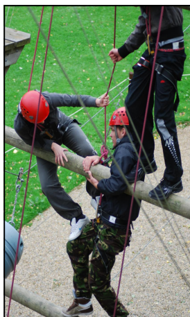
Middlesbrough College team-building day

During a normal working week in September the centre experienced what was undoubtedly its busiest couple of days. The centre was already at residential capacity with